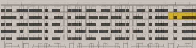
FACHADA | FACADE | FAÇADE