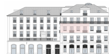
RUA DO BOQUERÃO DE LAMA