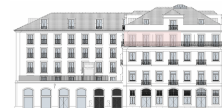
RUA DO BOQUERÃO DE LAMA